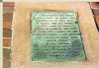
Site of (Roots) Kunta Kente's Landing site