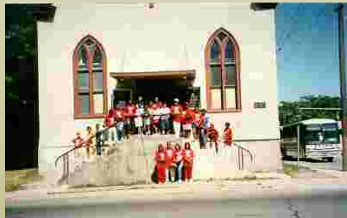
Last Stop on Harriet Tubman's Underground Rail Road

Whether you're attending a conference, bringing a Youth or Senior group, we can get you there safely and on time. If you're visiting Chicago, let us point out the history, heritage and culture of African-Americans in Chicago on the way to and from your event. We can tell you about the history and congregations of some of our leading and historical churches like Pilgrim Baptist where Thomas Dorsey wrote Amazing Grace or the oldest Black church in Chicago and the choir where Mahalia Jackson got her start.